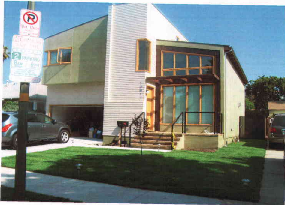
FRONT VIEW (7-27-2009)

If submitting more photographs than will fit on the preceding page, affix the additional photographs below. Identify all photographs with: date taken; "Front View" and "Rear View"; and, if required, "Right Side View" and "Left Side View."