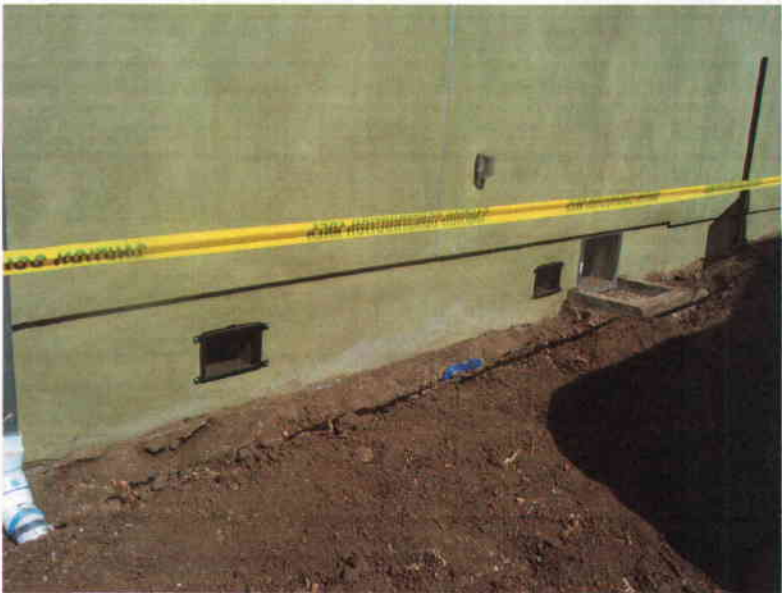
RIGHT SIDE VIEW (7/20/2009)