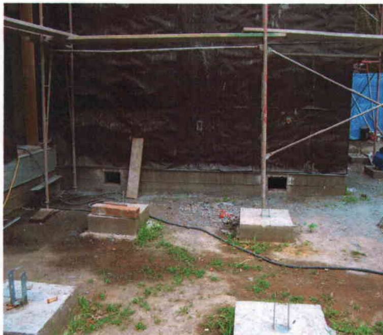
REAR SIDE VIEW (4/27/2009)