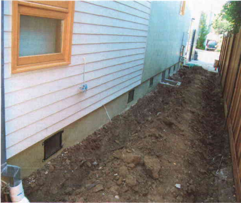
LEFT SIDE VIEW (7/20/2009)