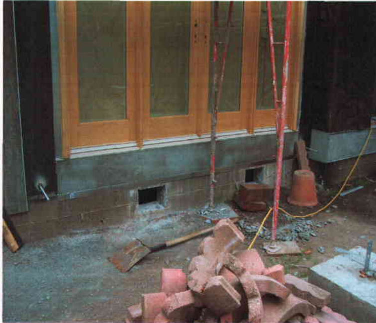
REAR RIGHT VIEW (4/27/2009)