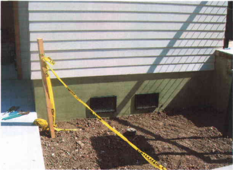
FRONT VIEW (7/20/2009)

If submitting more photographs than will fit on the preceding page, affix the additional photographs below. Identify all photographs with: date taken; "Front View" and "Rear View"; and, if required, "Right Side View" and "Left Side View."