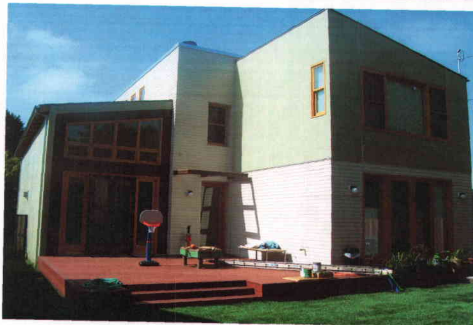
REAR VIEW (7-27-2009)