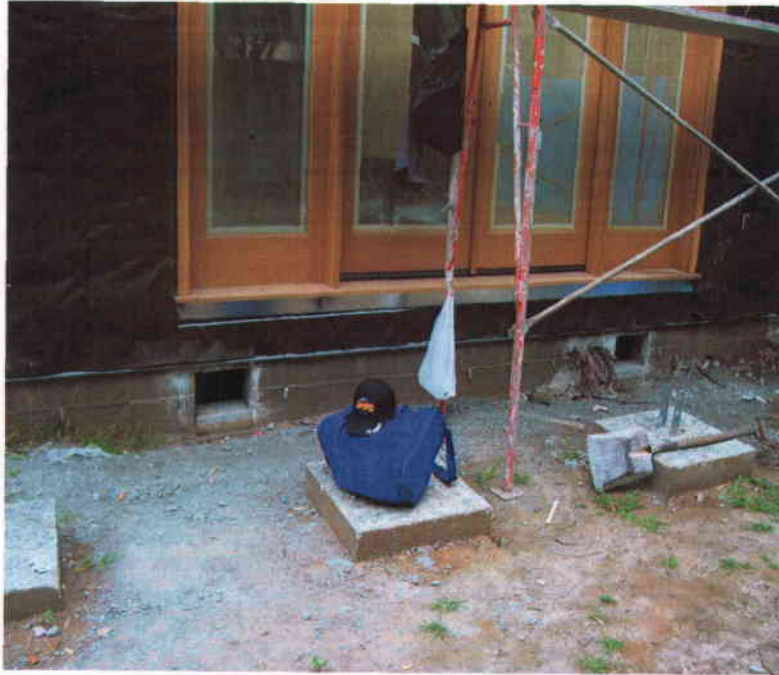
REAR RIGHT VIEW (4/27/2009)

If submitting more photographs than will fit on the preceding page, affix the additional photographs below. Identify all photographs with: date taken; "Front View" and "Rear View"; and, if required, "Right Side View" and "Left Side View."