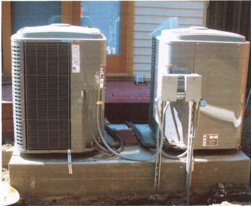
2 AIR CONDITIONERS (7-20/2009) PER C2e

If submitting more photographs than will fit on the preceding page, affix the additional photographs below. Identify all photographs with: date taken; "Front View" and "Rear View"; and, if required, "Right Side View" and "Left Side View."