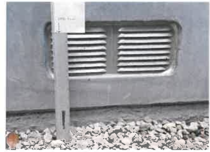
East Side (north end) ✓