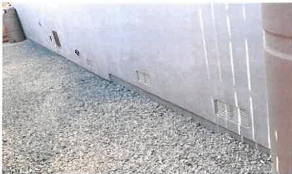
West side (northern end) ✓