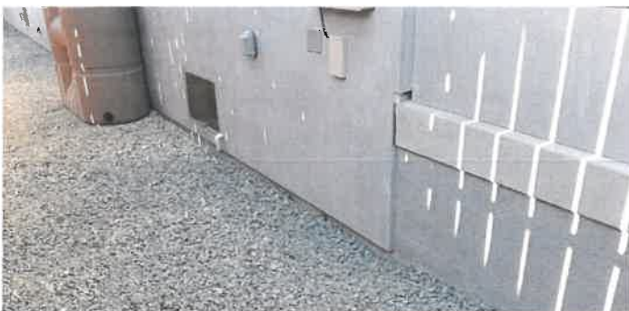
West side (southern end) ✓