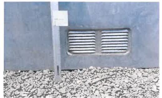
East Side (south end) ✓