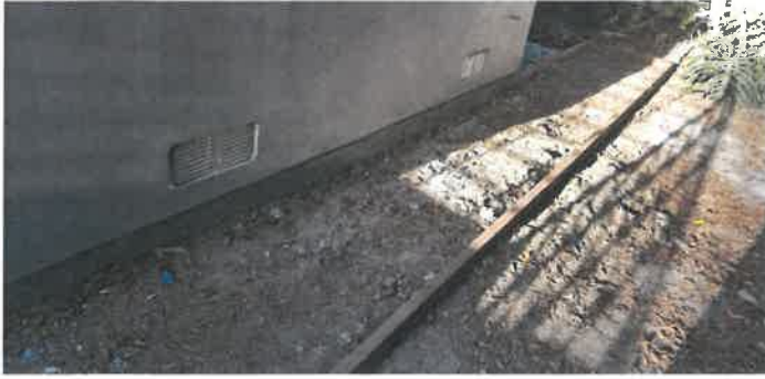
South side ✓

Post-it note is at 1' mark on the ruler.