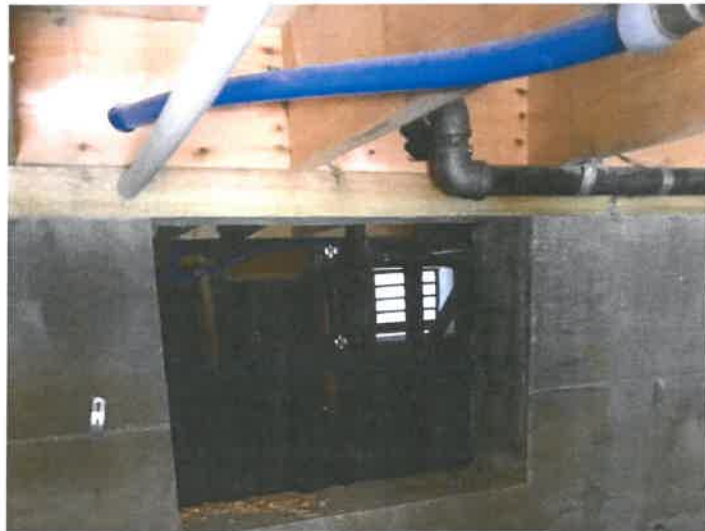
Photo 9 07/13/18 Interior- Back Vent Near the Porch