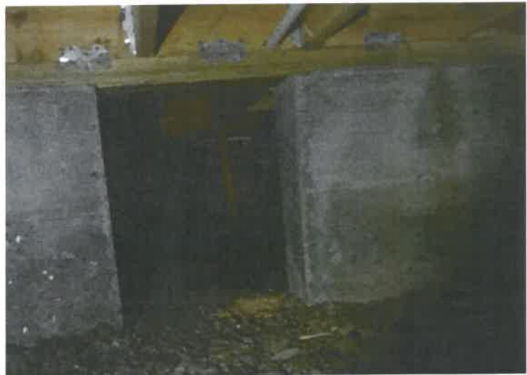
Photo 9: 07/13/18 Interior – Front Vent In between the Garage North Wall Vent And the front of home Vent under the stairs