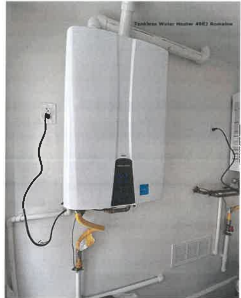
Clear Photo Three