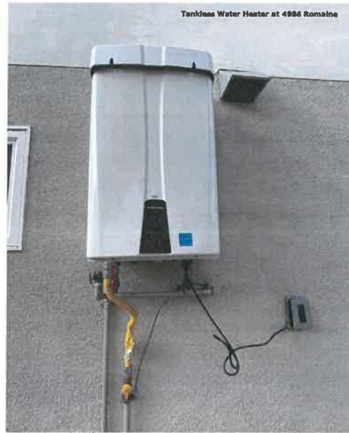
Tankless Water Heater at 4986 Romaine