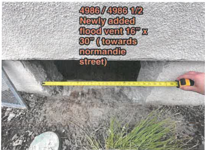
4986 / 4986 1/2 Newly added flood vent 16" x 30" (towards normandie street)