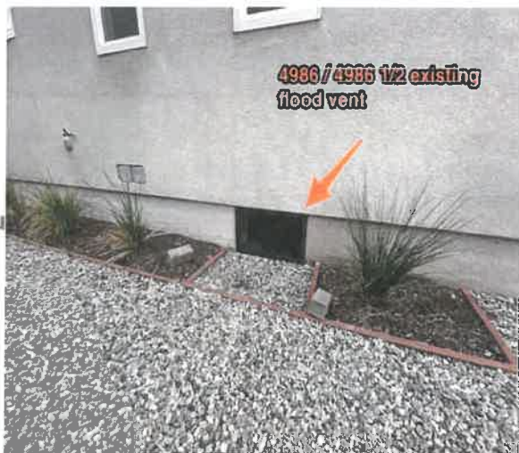
4986 / 4986 1/2 existing flood vent