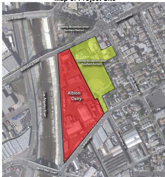
Map of Project Site